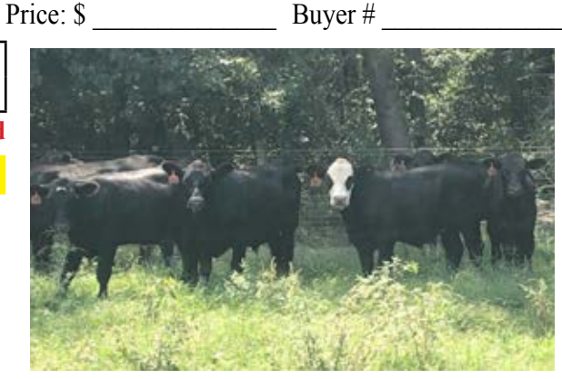
Flesh: Medium Frame: Medium

Nutrition: TMR with free choice pasture, minerals, and hay.