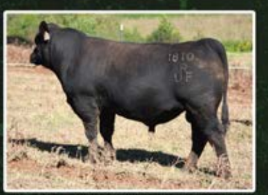
URF ACHIEVEMENT 1810 AAA 19341316 Poss Achievement x Quaker Hill Rampage 0A36 CED 8W WW YW SC +11 +.6 +68 +122 +1.81