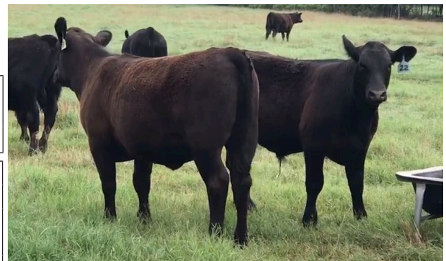
Heifers sell $.06 back.

Delivery Date: July 22 - 26 Shrink: None Notice to load: 48 hours Slide: $5/cwt topside only Conditions: Hauled 20 miles, weighed on the ground. Nutrition: 6# per head per day of 13% CPC Grower with free choice mineral, pasture, and hay. Vaccinations: Vista Once SQ (2x), Vision 7 (1x), Vision 8 (1x) Implants: None Dewormer: Eprinex (2x), Ivomec (1x) Genetics: Angus and SimAngus genetics. Sired by Angus and SimAngus bulls from Yon and Blackcrest. Other: Weaned 60+ days. Bunk broke, very docile.