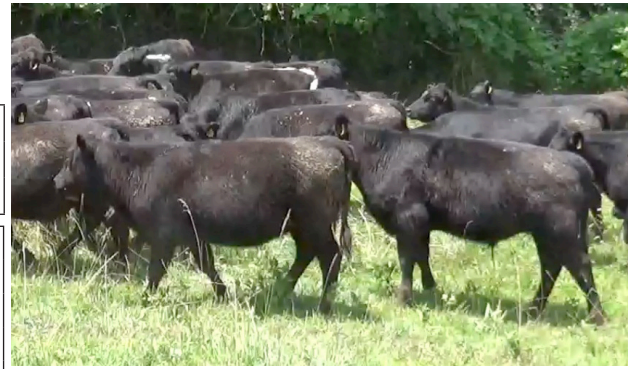
Heifers sell $.08 back.

Delivery Date: August 6 - 9 Shrink: None Notice to load: 48 hours Slide: $7/cwt topside only Conditions: Hauled 25 miles, weighed on the ground. Nutrition: 8# per head per day of 14% grower pellet feed with fescue pasture, mineral, and hay. Vaccinations: Vista Once (1x), Vista 5 (1x), Inforce 3 (1x) Vision 7 (1x), Covexin 8 (1x) -w/somnus (1x) Implants: Revalor G Dewormer: Dectomax Inject (1x), Safeguard (1x) Genetics: Predominantly Angus genetics, sired by Angus & SimAngus bulls out of Angus-x-Continental cows. Sires are sons of SydGen Black Diamond and EF Cruise Control. Other: Weaned 90+ days. Bunk broke, very docile.