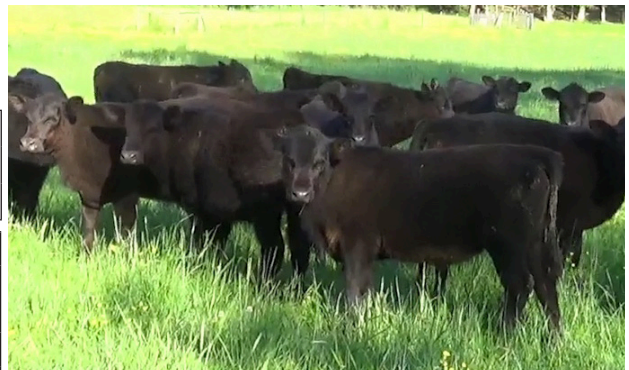
Heifers sell $.12 back.